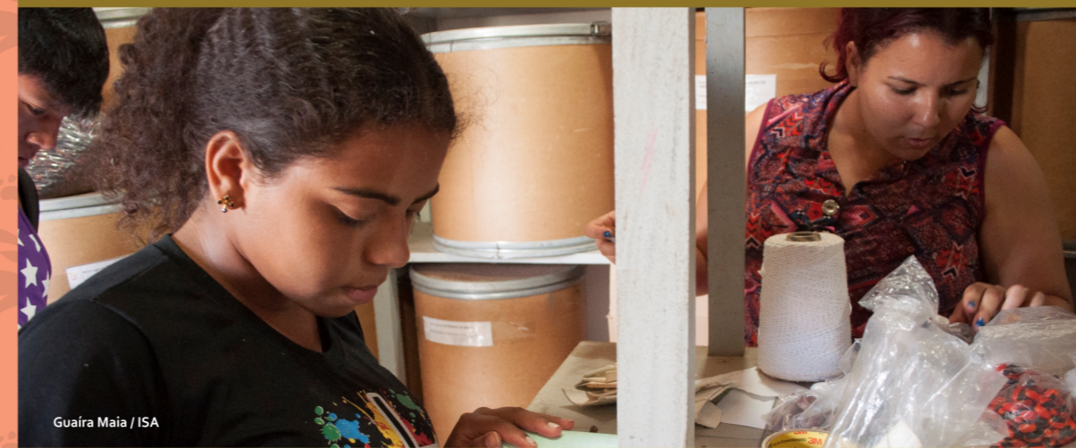
Guaira Maia / ISA

This is the most economical and efficient technique to quickly reforest areas of different sizes, and which also guarantees optimal germination rates and densification of the restored area. In addition, it is scientifically proven that the variety of the genetic composition of the seeds of the Network makes the germination of young forests more protected against diseases and extreme weather events.